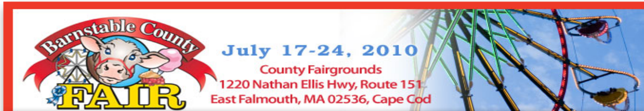
Exhibit a Quilt at the Barnstable Fair and receive an Exhibitors Pass to a day at the Fair!

Exhibits will be received ONLY on Tuesday, July 13, 2010 from 3:00 PM to 7:00 PM